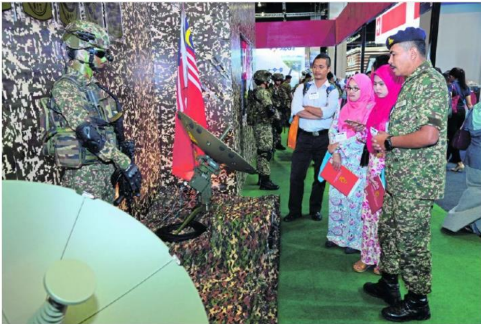
The Army Pavilion is one of the booths worth visiting.

FOLLOWING a four-year hiatus, the highly anticipated Defence Services Asia (DSA) exhibition and National Security (NATSEC) Asia series will be making a well-received comeback to the Malaysia International Trade and Exhibition Centre from March 28 to 31.