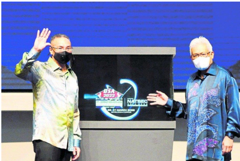
The DSA and NATSEC Asia 2022 Launch Ceremony was inaugurated by Senior Defence Minister Datuk Seri Hishammuddin Hussein (left) and Home Minister Datuk Seri Hamzah Zainudin.

Themed "The Future of Cybersecurity in Southeast Asia", the conference aims to provide participants with the latest threats, insights and vulnerabilities by international speakers and leaders in the industry.