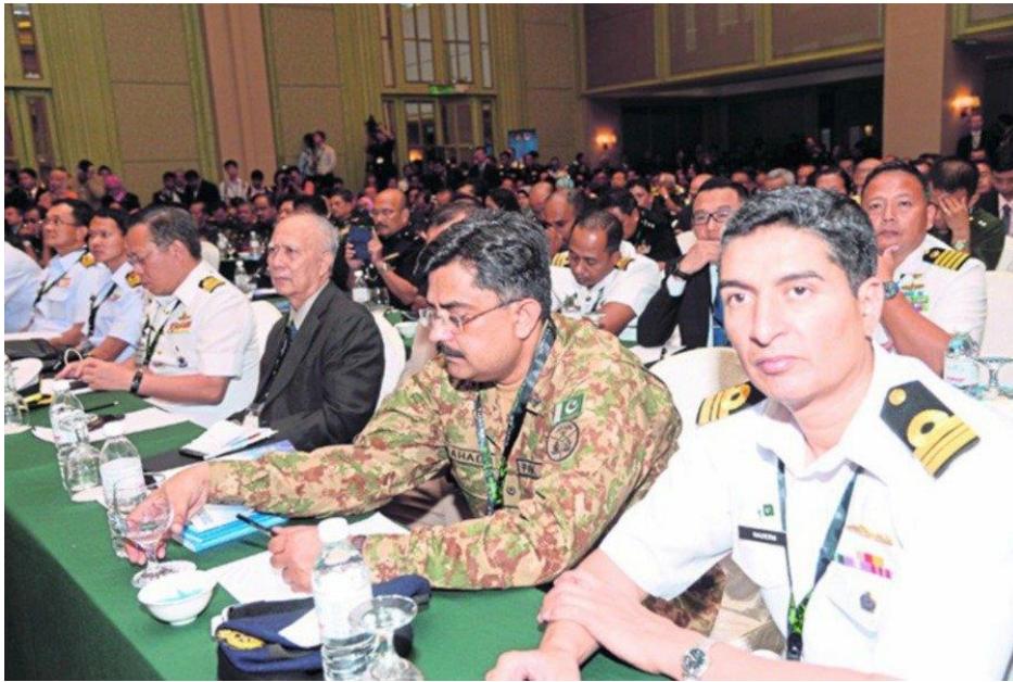
The Putrajaya Forum provides a platform for stakeholders to address defence and security concerns.