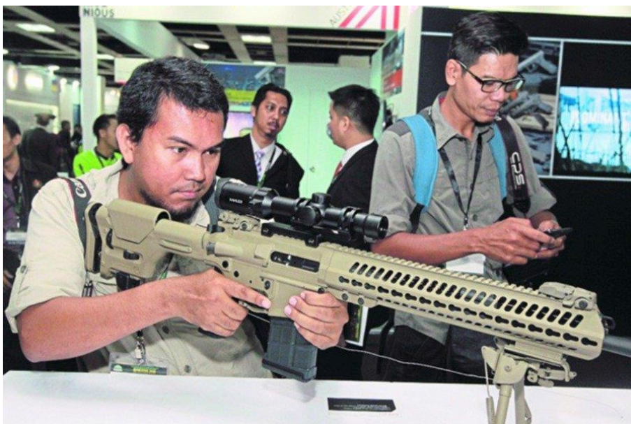
One of the draws for visitors to the DSA & NATSEC Asia is the opportunity to experience the weapons and assets on show.

Due to the pandemic, the issues of defence and national security are highly important as they have the potential to exacerbate global instability in many ways. In this context, instability may result in a number of complex security risks, such as increased risk factors for radicalisation, violent extremism, and border security issues.